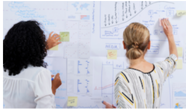
Sales & Marketing