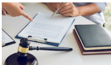
Legal & Compliance