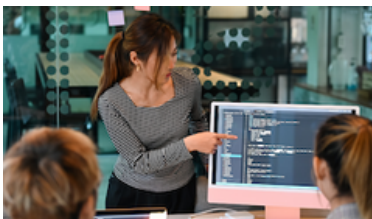
Operations & Technology