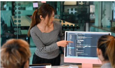
Operations & Technology