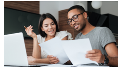
Finance & Accounting