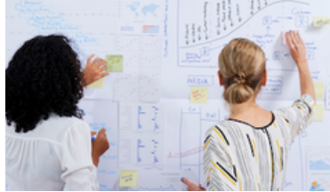
Sales & Marketing