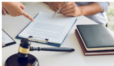
Legal & Compliance